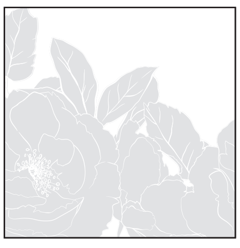
Sized only as shown